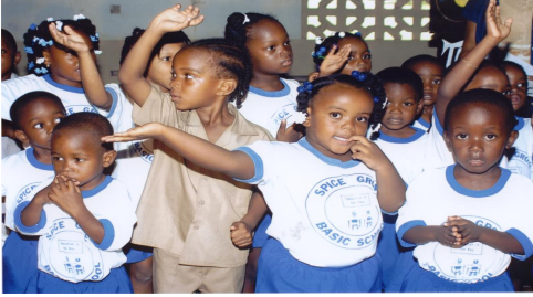
JISA Conference - April 2009