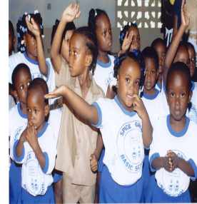
JISA Conference - April 2009