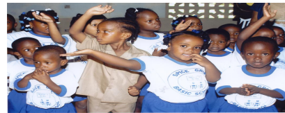
JISA Conference - April 2009